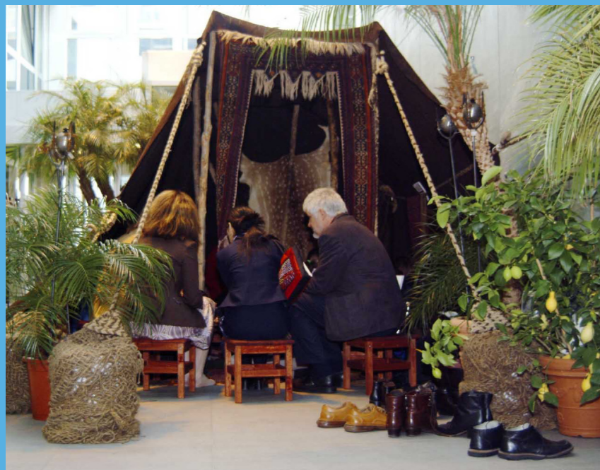
The storytelling tent created for the Dare to Share Fair in 2004. Visitors were invited to remove their shoes, entering as strangers and leaving as friends.

Story telling energises us to connect with each other. Simple stories can illuminate complex patterns and deeper truths – one should never underestimate the power of the particular. The process of telling your story – and being heard and understood by others – can be empowering. Weaving narrative elements into more traditional reports captures the reader's attention while also signalling that many voices and perspectives are valued.